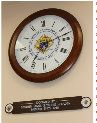
Clock on the wall of our Council Hall